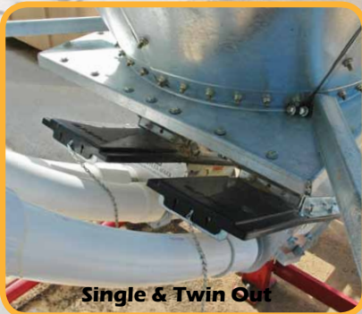
Single & Twin Out