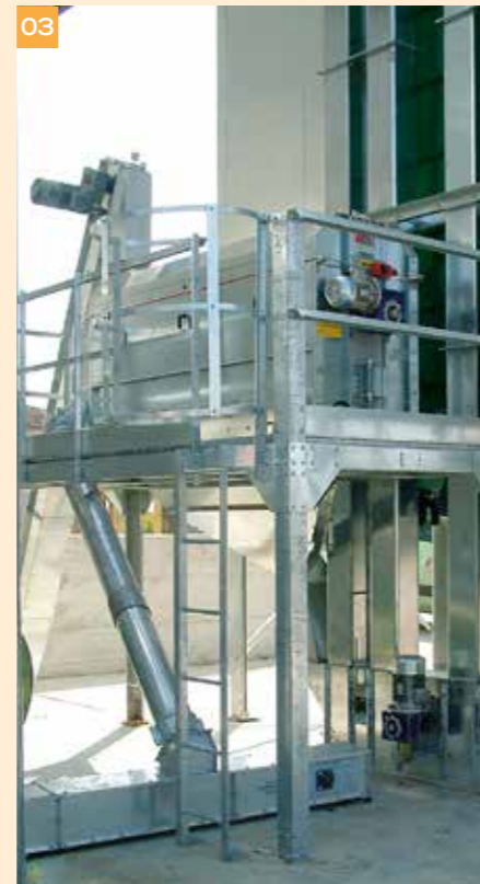
01, 02, 03 - Installation examples